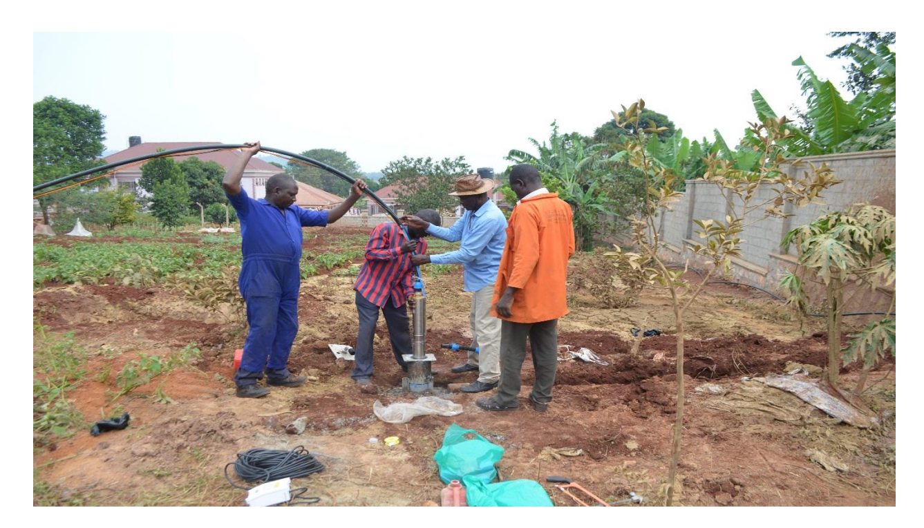
Figure 16: Expenditure on utility bills need to be cut further by improvising a solar system for the motorised water pump that was installed at Home of Hope in the month of August 2023 to avoid high electricity bills.