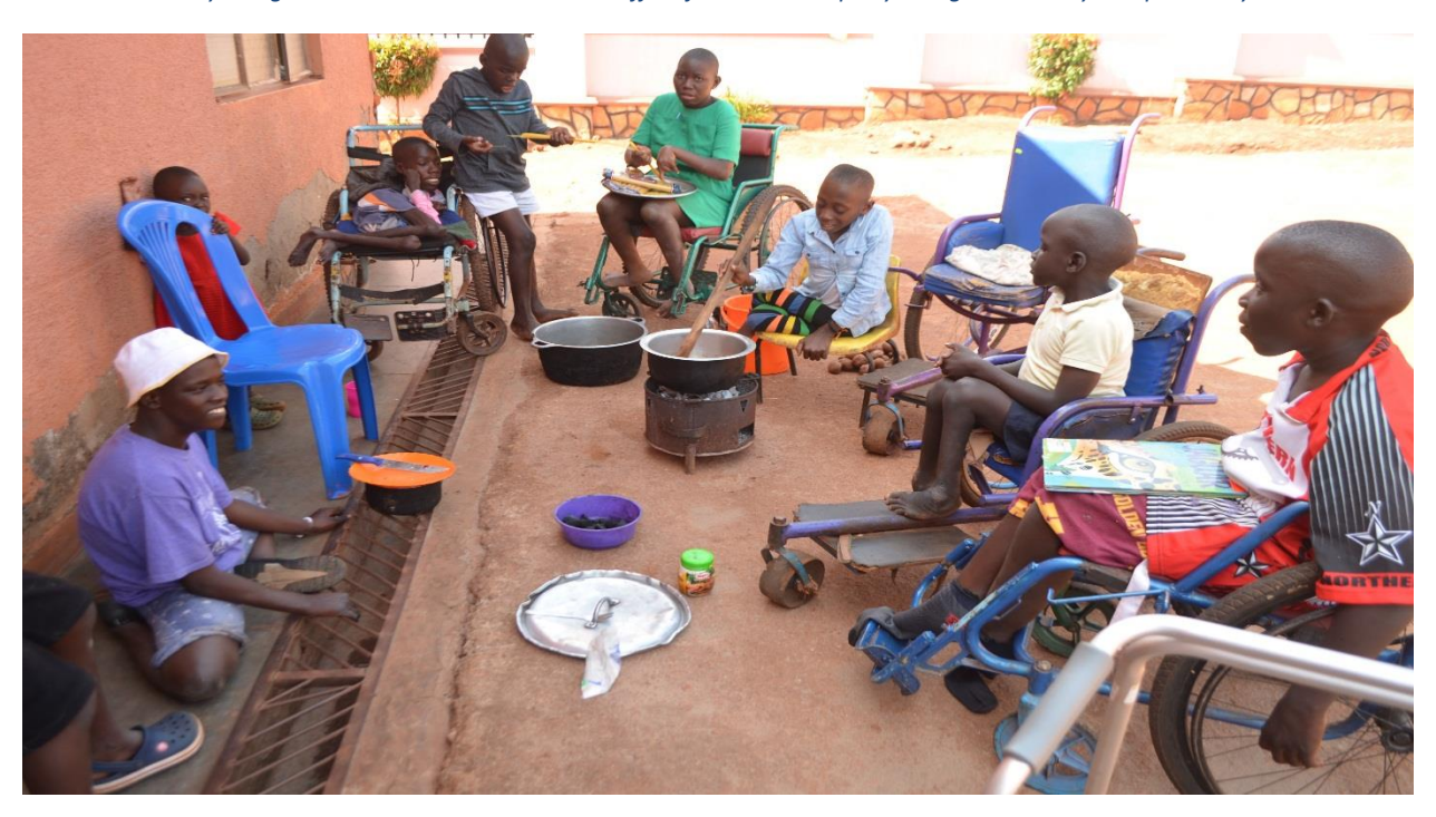
Figure 7: As we prepare the children to live independently they deserve the chance to learn the skills that support independent living and hands-on skilling makes the young adults learn better. Above are Home of Hope children cooking food for a meal as a practical way of equipping them with daily living skills. This also helps in team building since they all participate.