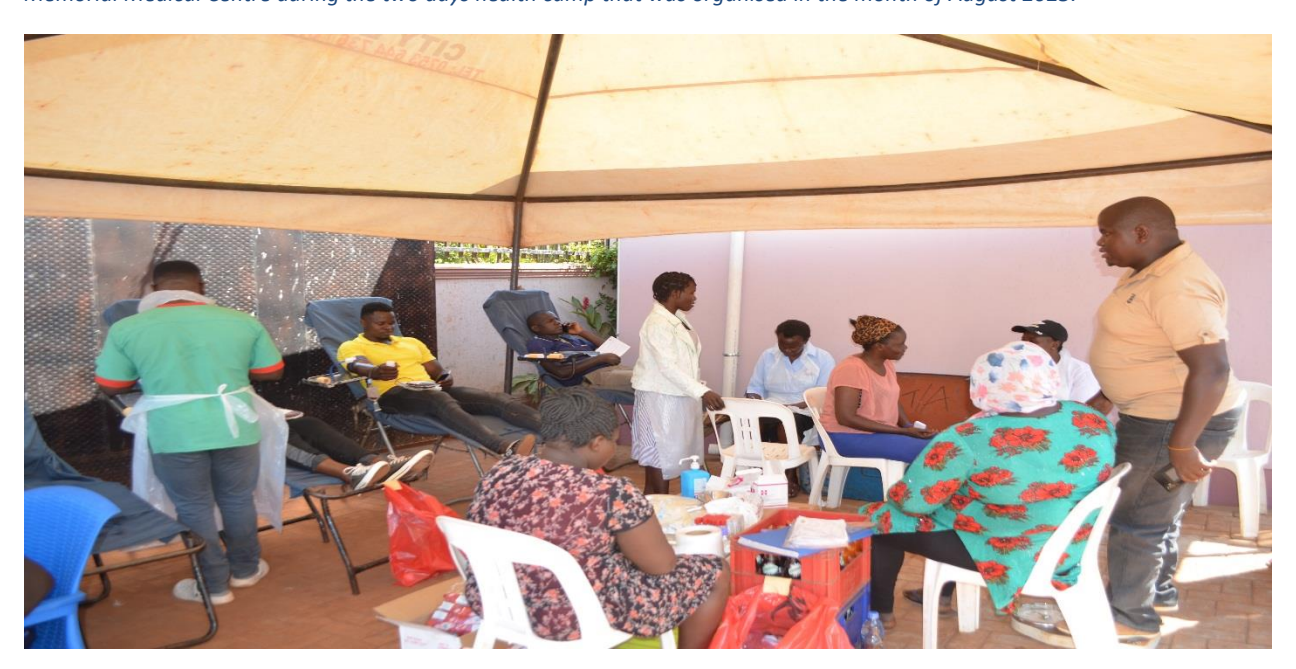
Figure 13: Blood donation was part of the activities that was involved in the health camp held in August 2023.