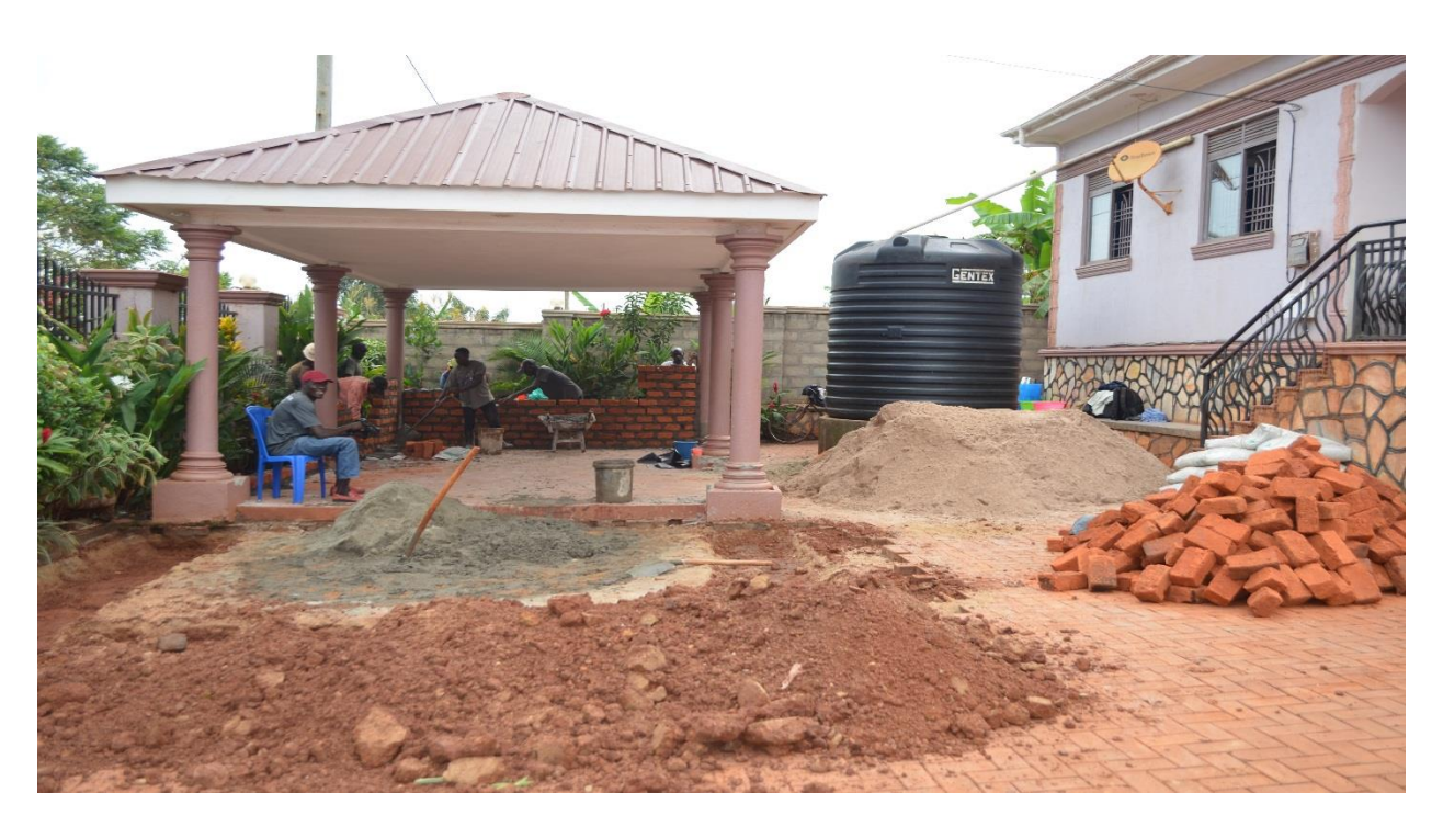
Figure 17: Kick-starting the transformation of the waiting shade at Derrick and Emily Memorial Medical Centre to create space for more services.