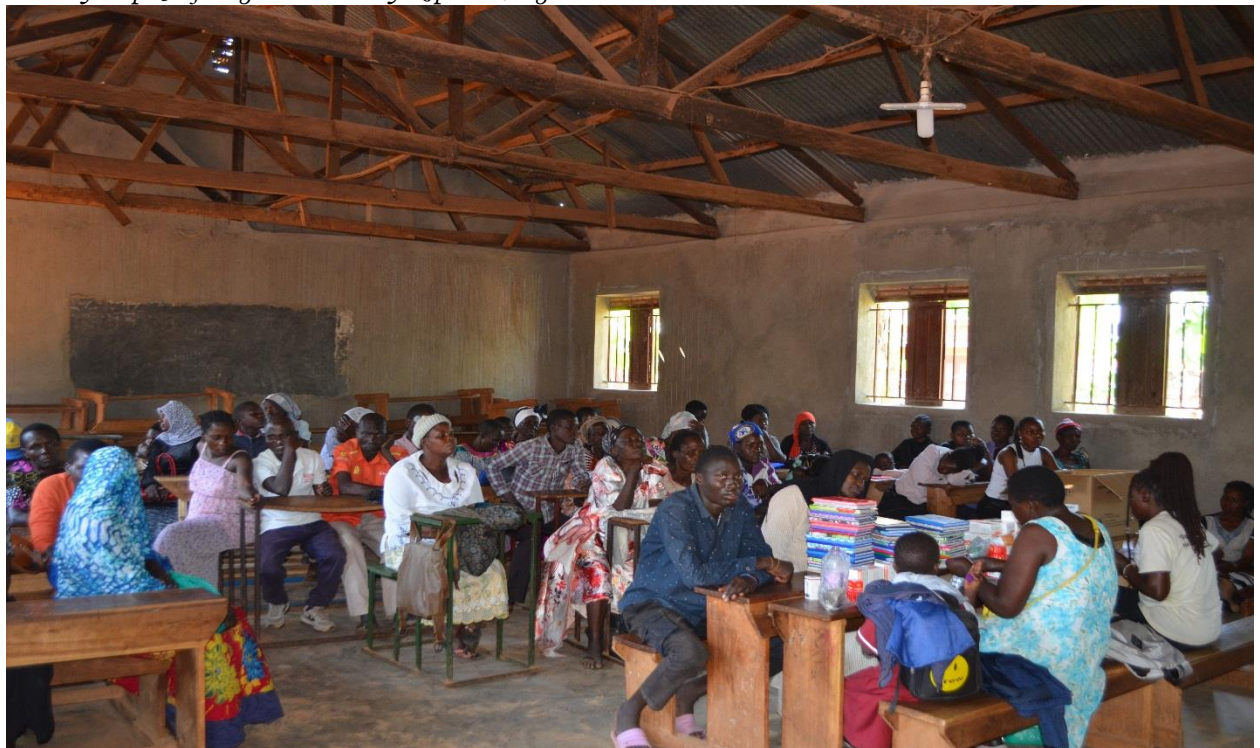
10: Across section of some of the participants who turned up for the outreach clinic in Buwenge Town Council. The outreach also benefits clients from the neighbouring sub counties of Buwenge Rural, Butagaya Sub County and also the neighbouring districts of Kamuli and Luuka.