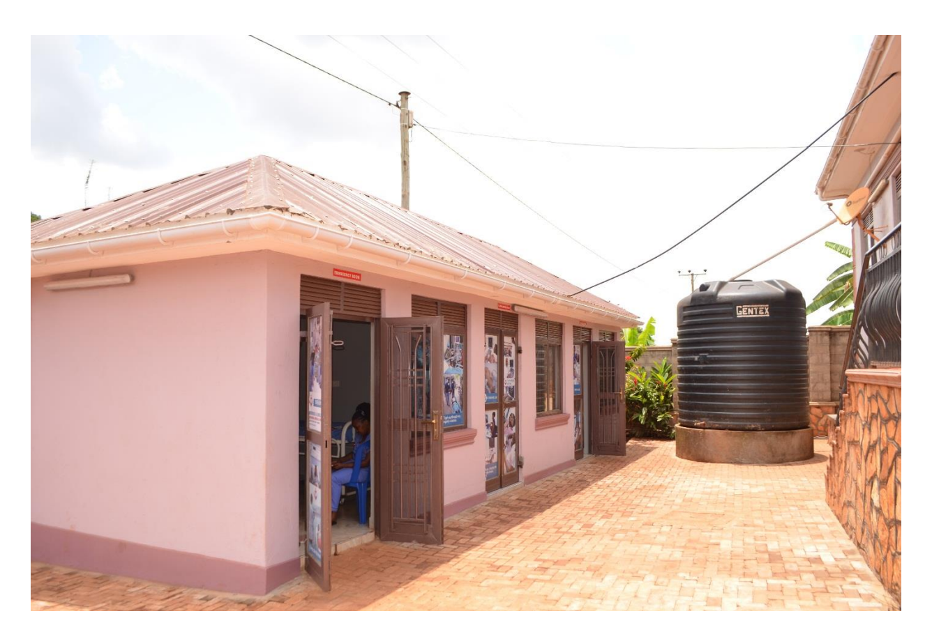
Figure 18: The shade above after re-construction now provides room for the Emergency, Ultra sound and Dental services at Derrick and Emily Memorial Medical Centre.