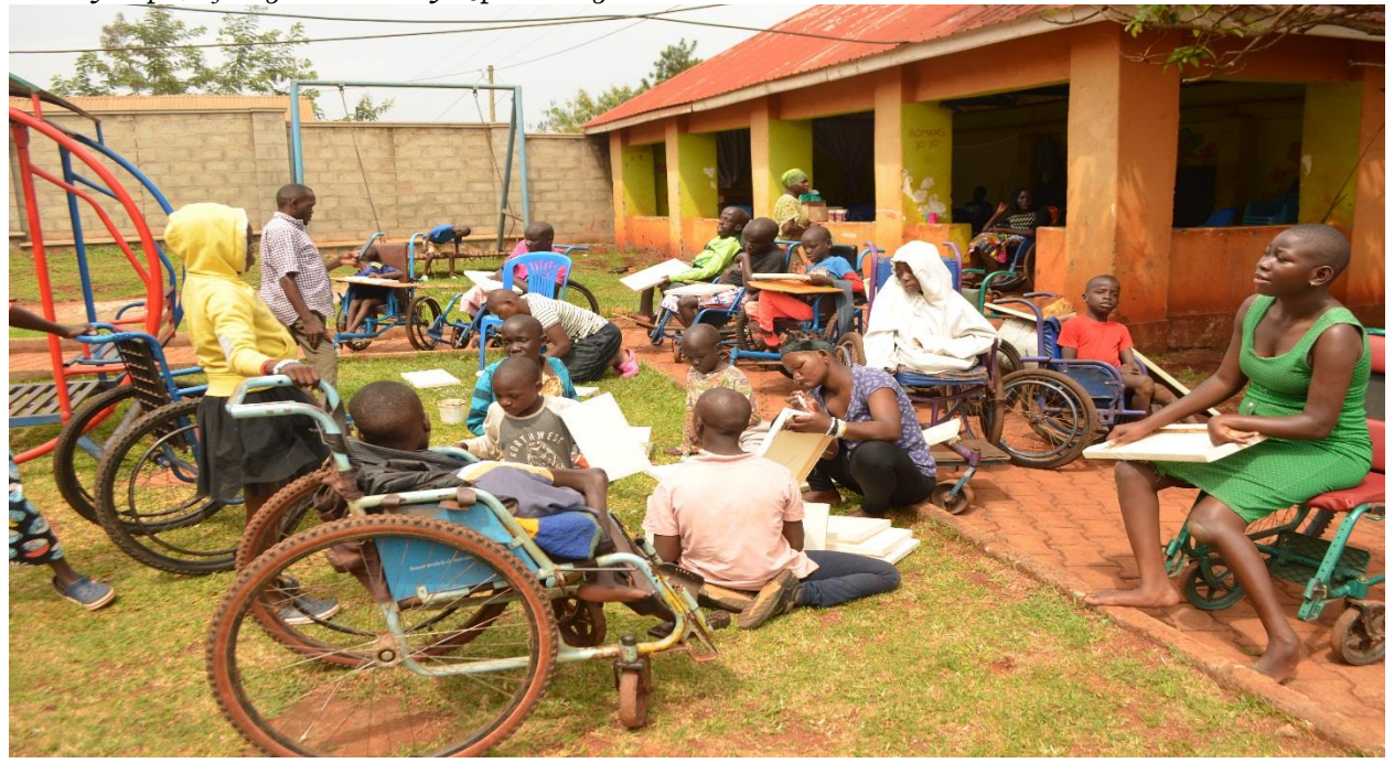
Figure 8: while out of school, the children are engaged in home based learning such as participating in Art and crafts based on their capabilities.