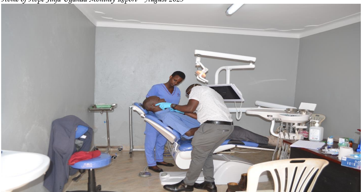
Figure 14: With the equipping of the dental section with the new dental chair, both the children and community have now gained access to dental services that have been lucking. Above is the Home of Hope dental Team offering dental services to a community member.