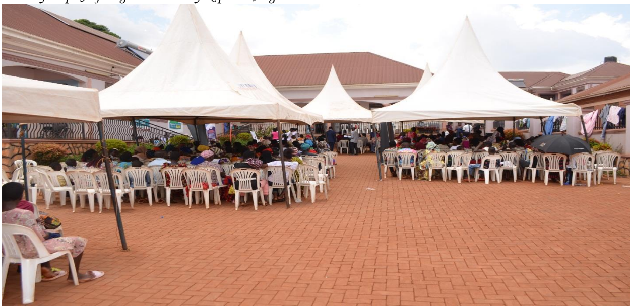
Figure 12: Community members turned up in big numbers to benefit from the services that are offered at Derrick and Emily Memorial Medical Centre during the two days health camp that was organised in the month of August 2023.